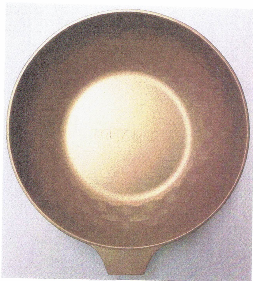
< KOREAKING DIAMOND X SERIES >

Remark: 1. This report is the result of test conducted by company's samples only. It does not guarantee the quality of all products. 2. This report cannot be used for advertisement, campaign, and legal purpose without KATR's permission. Do not use for any other purposes.